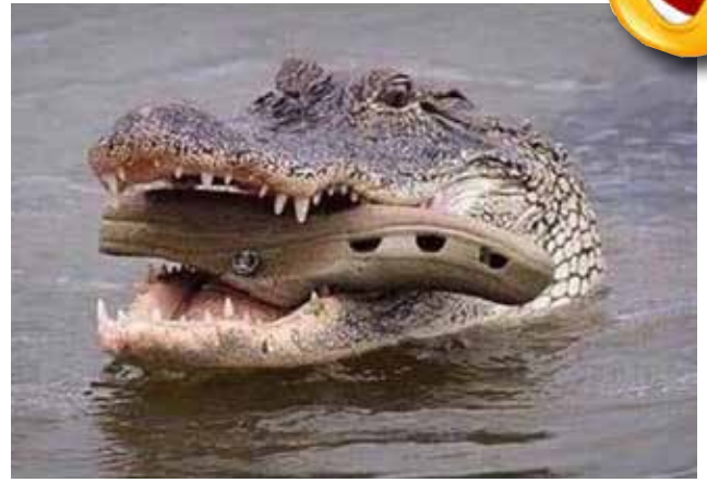
Look how instinctively, the mother croc carries the baby in its mouth. Nature is beautiful.